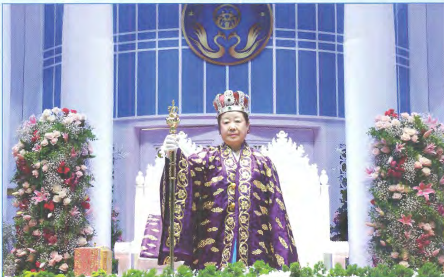
Above: True Mother holding the heavenly royal scepter with firm authority. Below: All that True Mother received representing True Parents' spiritual achievements she placed near True Father's throne.